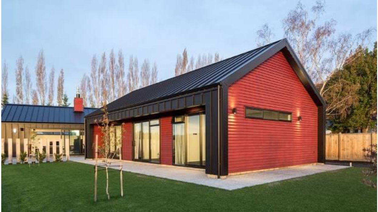
The house comprises two pavilions at right angles, which open up to the sun and the view.

The Resene judges admired Reece Warnock's use of colour as a "nod to nature nestled in the picturesque Otago landscape". "This barn-red home framed in black embraces the autumn tones of its surroundings."