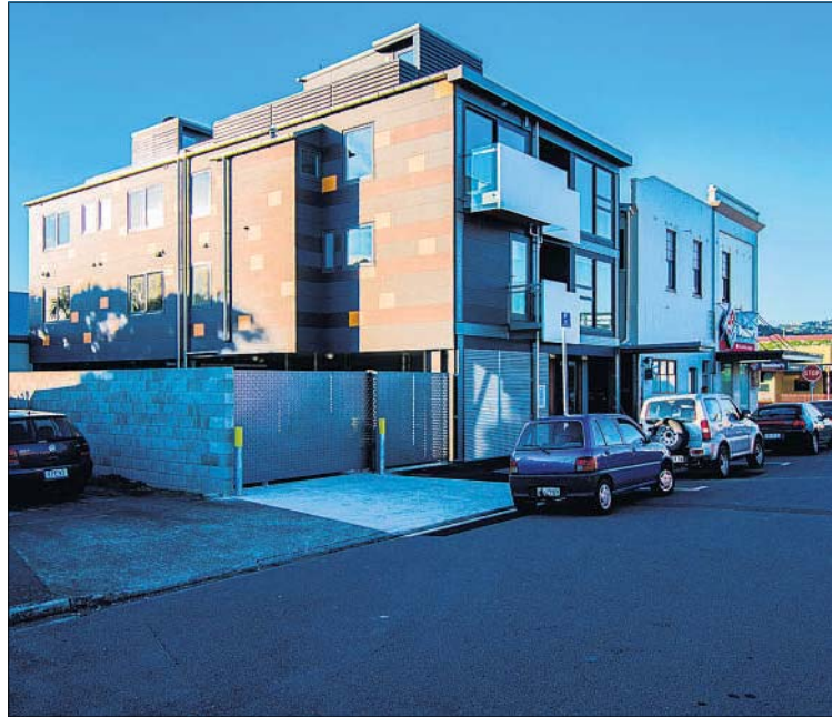
WOW: Award-winning Aurora Apartments created by Coast Edge.